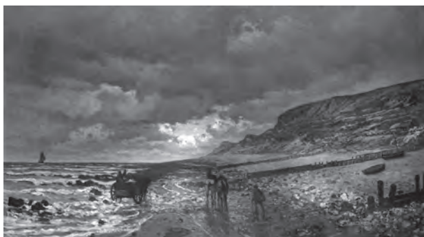
Claude Monet, The Pointe of Heve

Cassiodorus, a contemporary of Benedict's, was there at the beginning. He was among the first to recognize that Christianity had developed an intellectual culture worthy of transmission. He perceived the vital importance of study to the Christian life. He saw, moreover, that to engage with sacred texts, to pursue the knowledge of God, Christians must dedicate themselves to a panoply of arts and sciences. Writing in a period of turmoil even greater than our own, he cast a vision for education that has had a quiet influence down through the centuries.