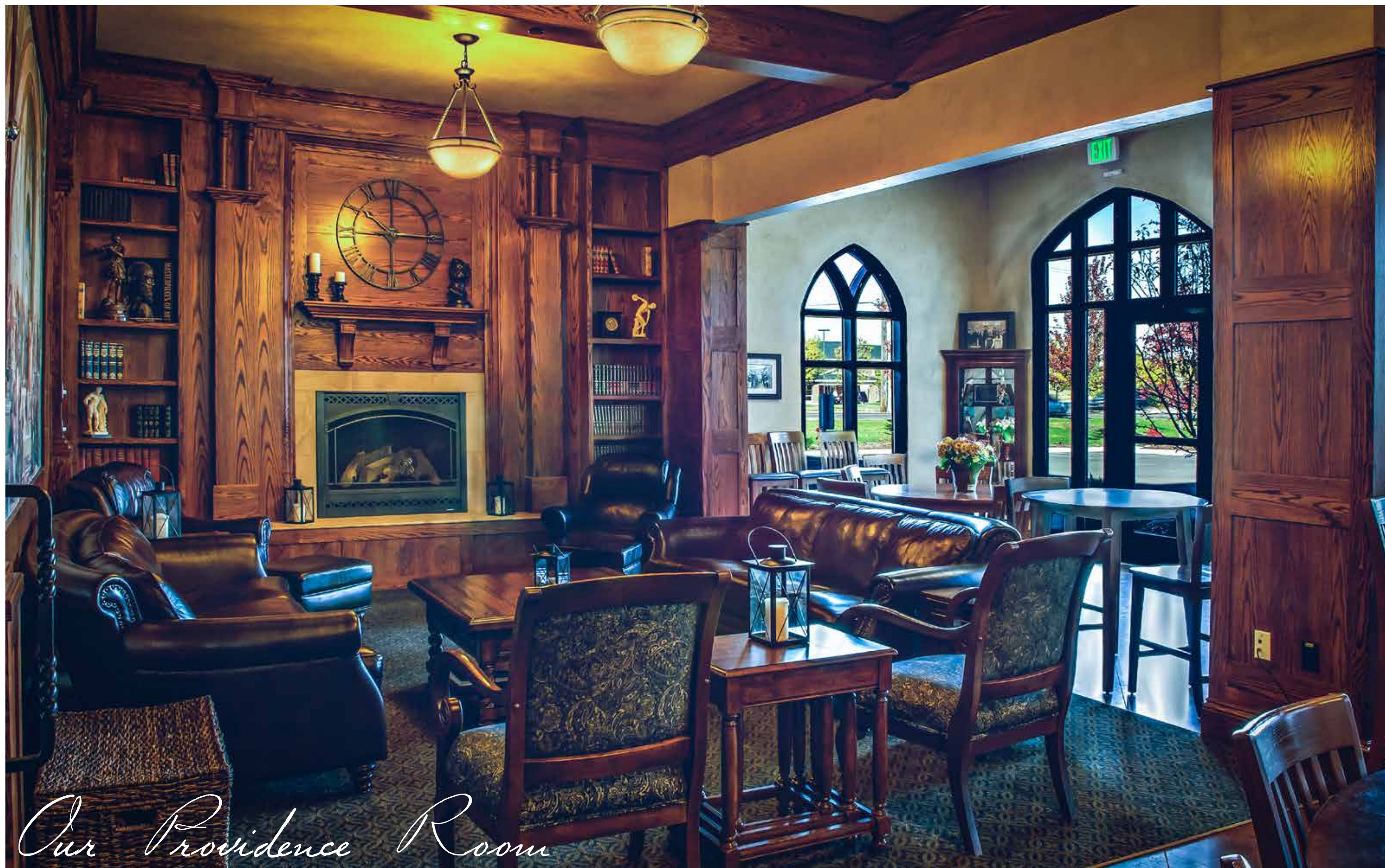
Our Providence Room